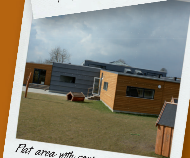
Flat area with some grass which is suitable for day nursery children