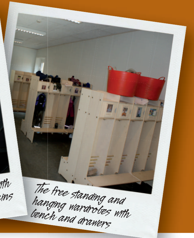
The free standing and hanging wardrobes with bench and drawers