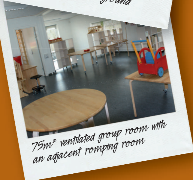
75m² ventilated group room with an adjacent romping room