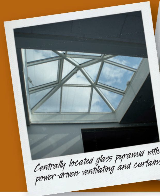
Centrally located glass pyramid with power-driven ventilating and curtains