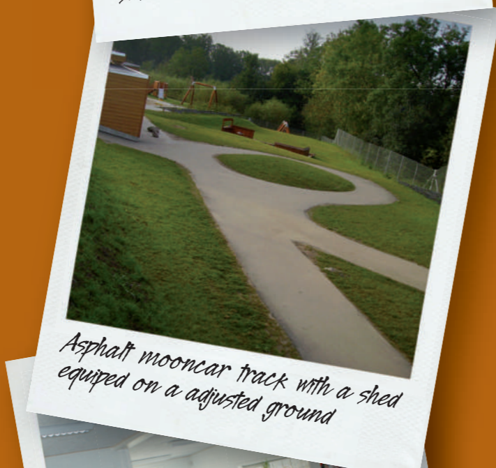
Asphalt mooncar track with a shed equipped on a adjusted ground