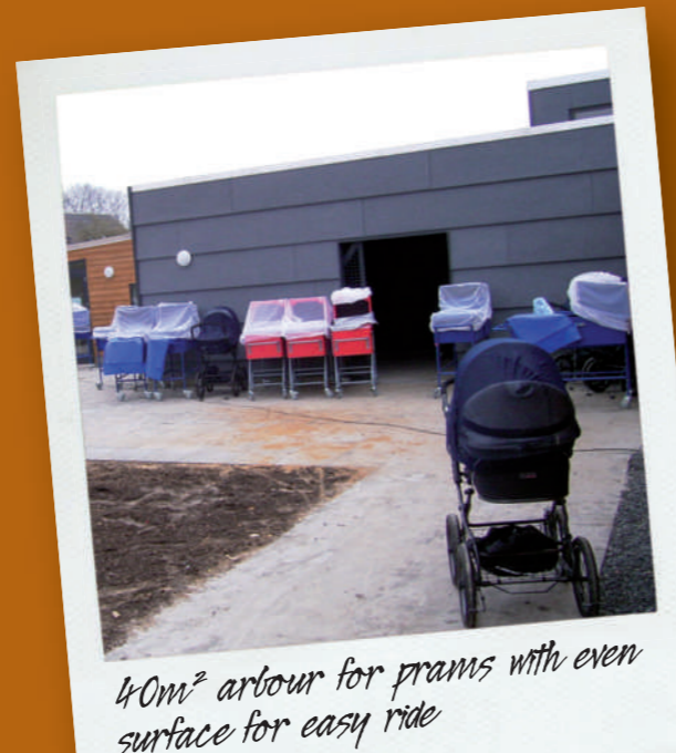
40m² arbour for prams with even surface for easy ride