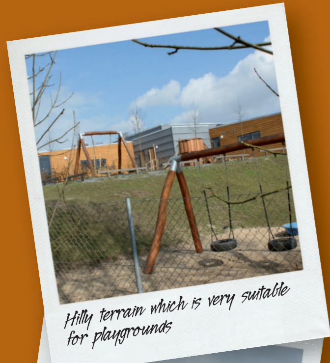
Hilly terrain which is very suitable for playgrounds